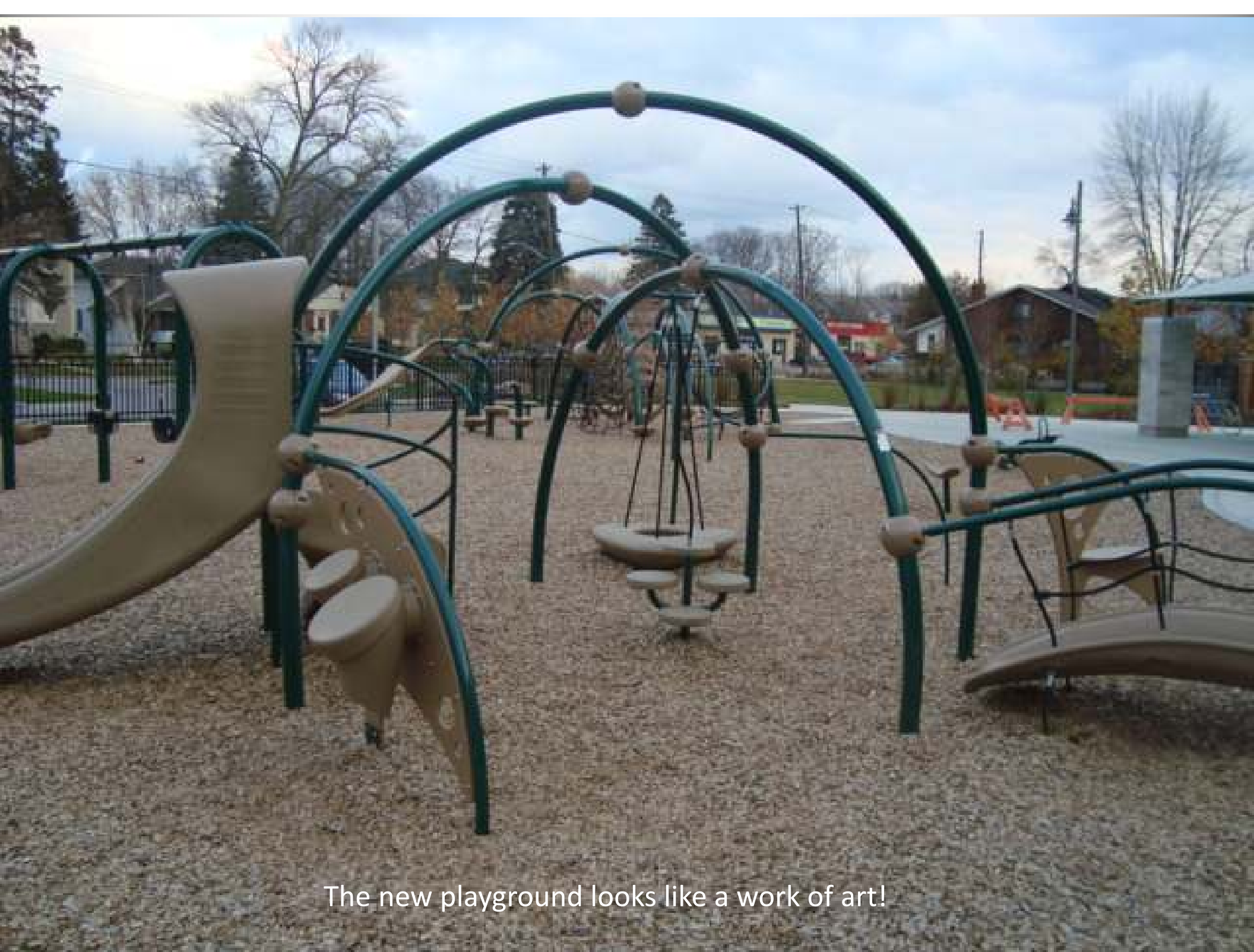
The new playground looks like a work of art!