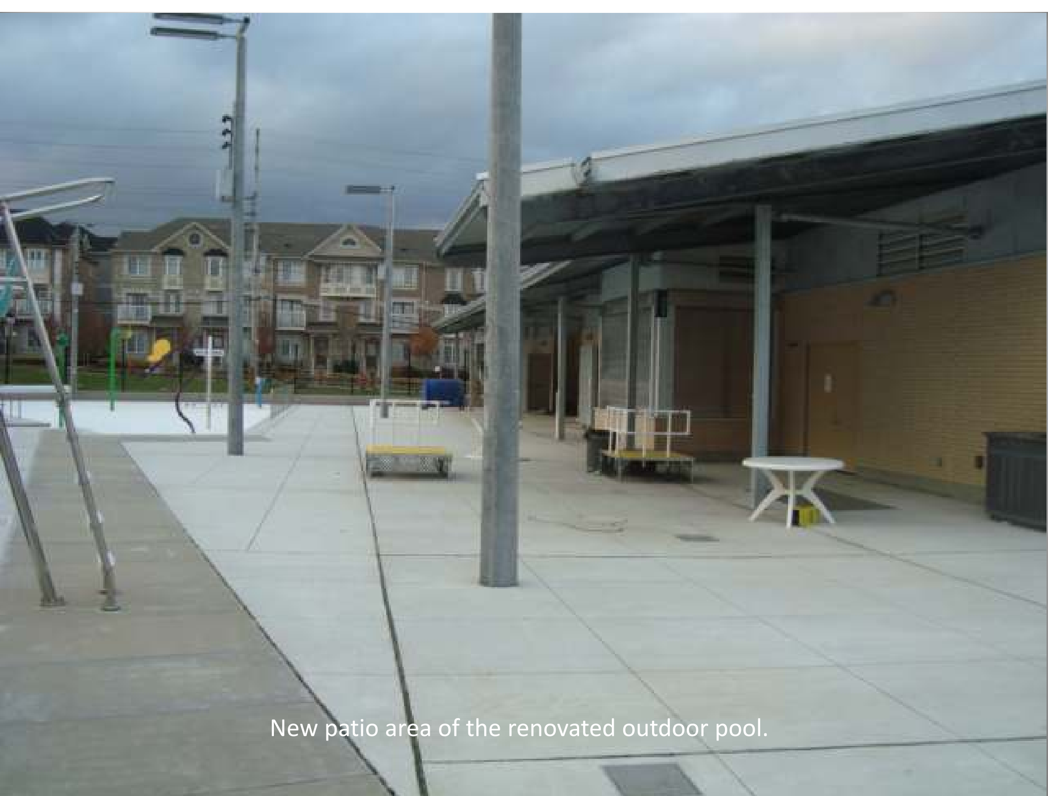
New patio area of the renovated outdoor pool.