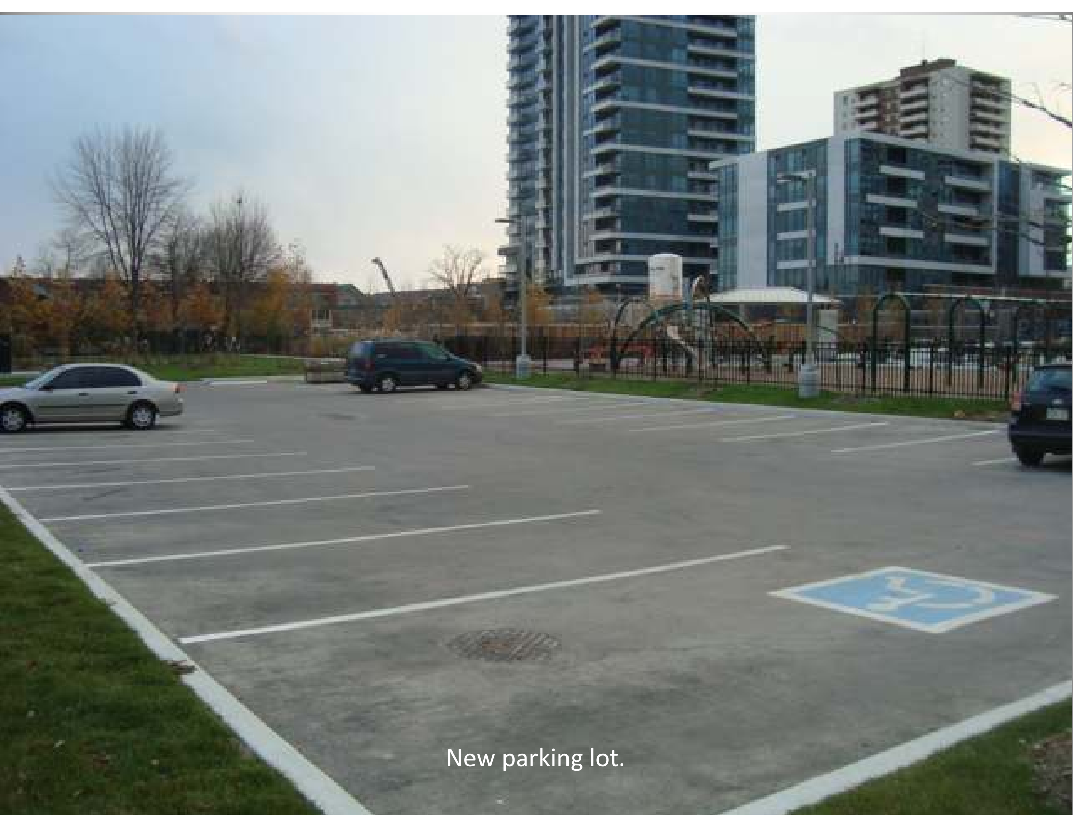
New parking lot.