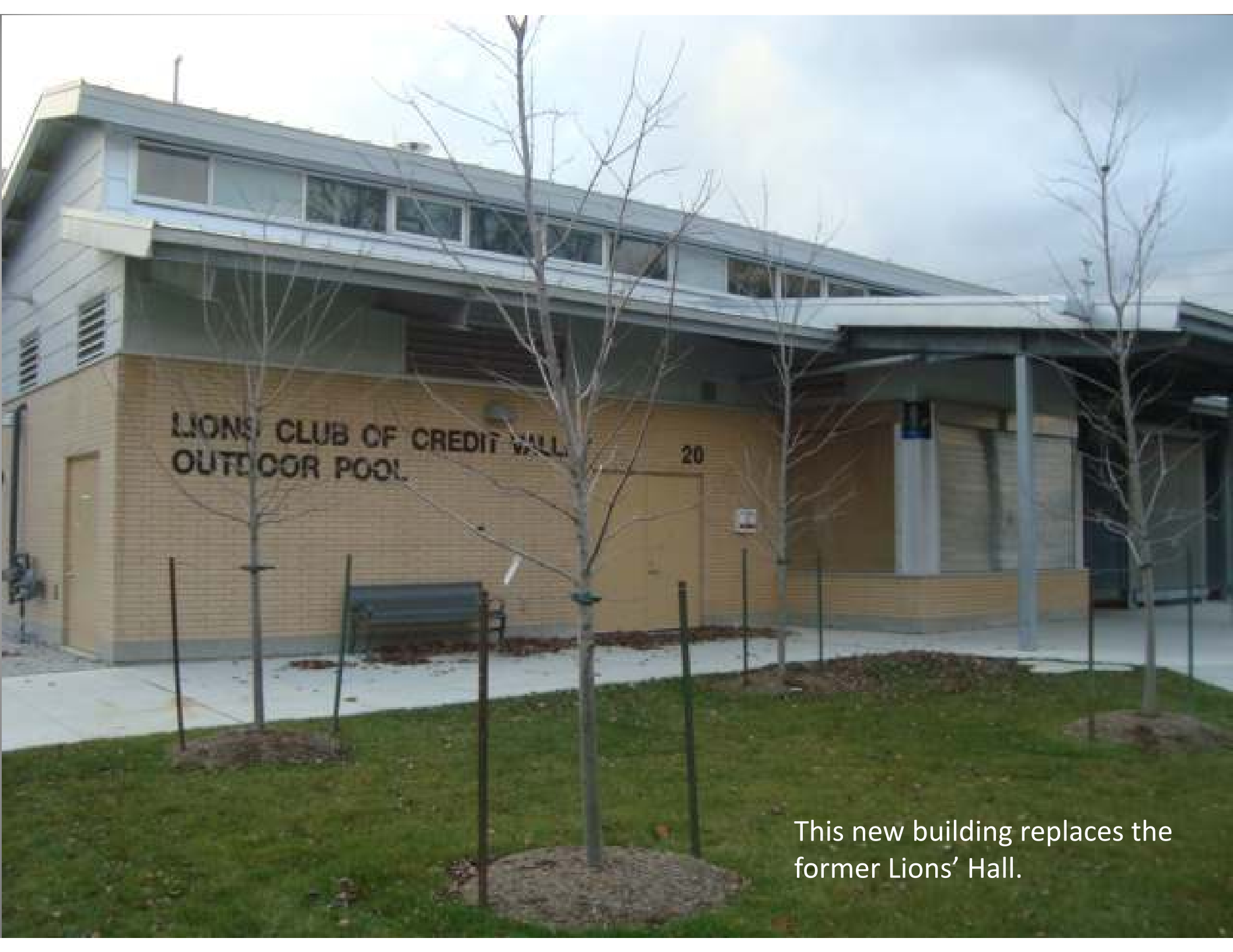
This new building replaces the former Lions' Hall.